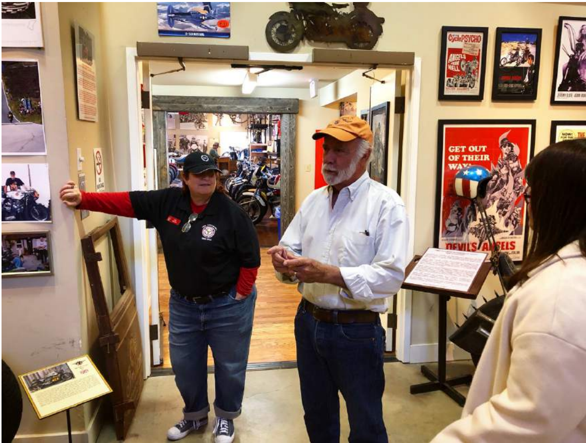
Moto Talbot Photos